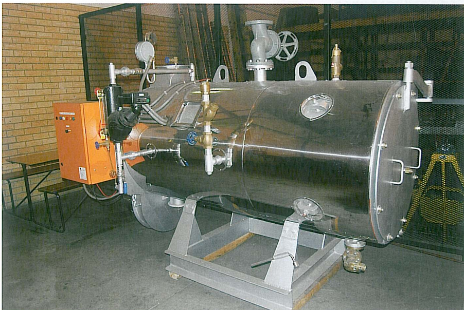
A boiler ready for delivery

generally now regarded as the Rolls Royce of gun-burners on the market.